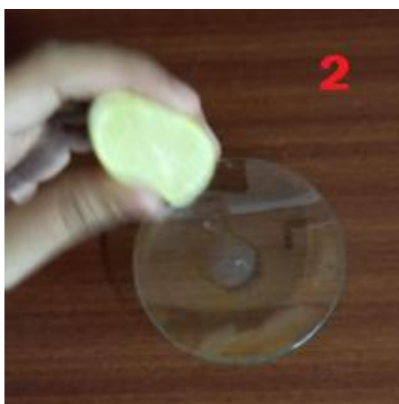
TAKE SOME FEW GLASS OF LEMON IN WATER GLASS