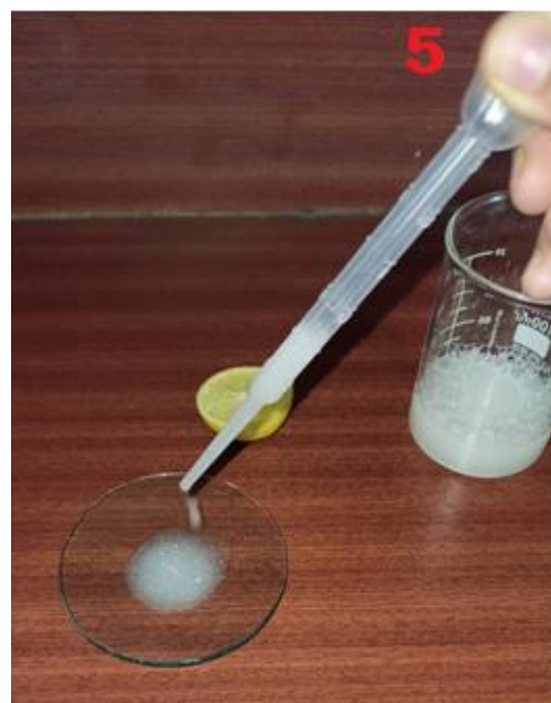
TAKE SOME WASHING POWDER DISSOLVED IN WATER IN ANOTHER WATCH GLASS