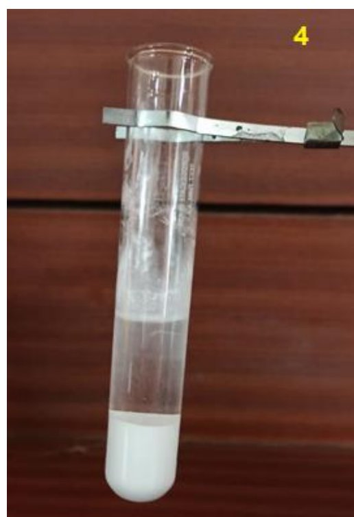
AFTER SOMETIME, CALCIUM HYDROXIDE IS FORMED AND COLLECTED AT THE BOTTOM OF TESTTUBE