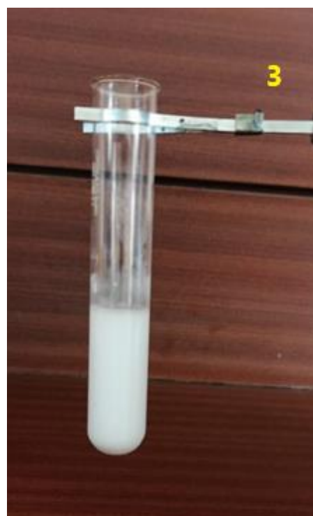
MIX IT WELL