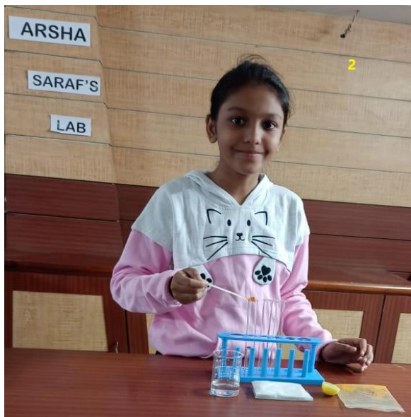
MIX WATER AND TURMERIC IN ONE TESTTUBE