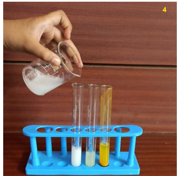
POUR SOME WASHING POWDER SOLUTION IN THIRD TESTTUBE