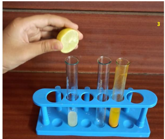
POUR SOME LEMON JUICE IN ANOTHER TESTTUBE