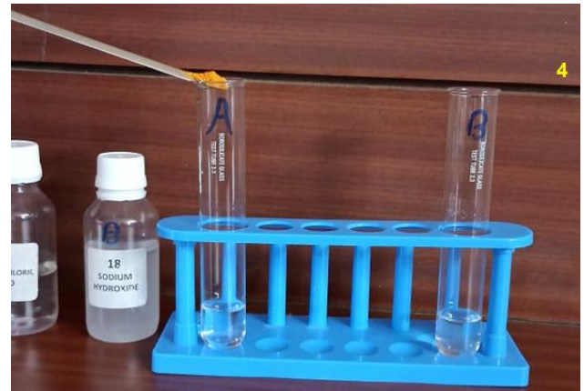
ADD TURMERIC TO BOTH THE TEST-TUBES