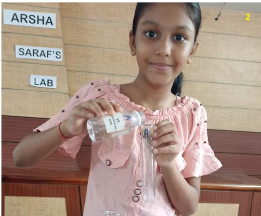
POUR SOME HYDROCHLORIC ACID IN TEST-TUBE A