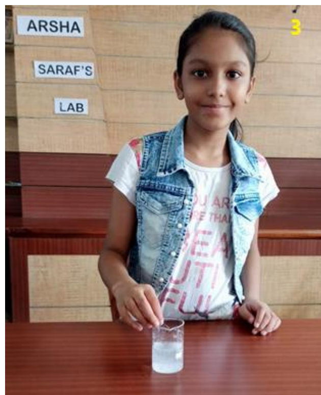
PUT 2 IRON NAILS IN THE SOLUTION