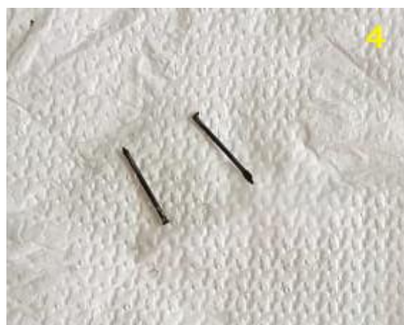
COATING OF ZINC IS DEPOSITED ON IRON NAILS.

More reactive metal displaces less reactive metal from its salt solution