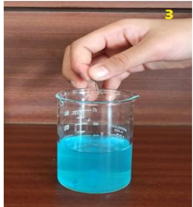
PUT TWO IRON NAILS IN THE SOLUTION