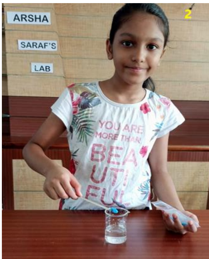
ADD 2 SPATULA OF COPPER SULPHATE IN BEAKER AND DISSOLVE IT.