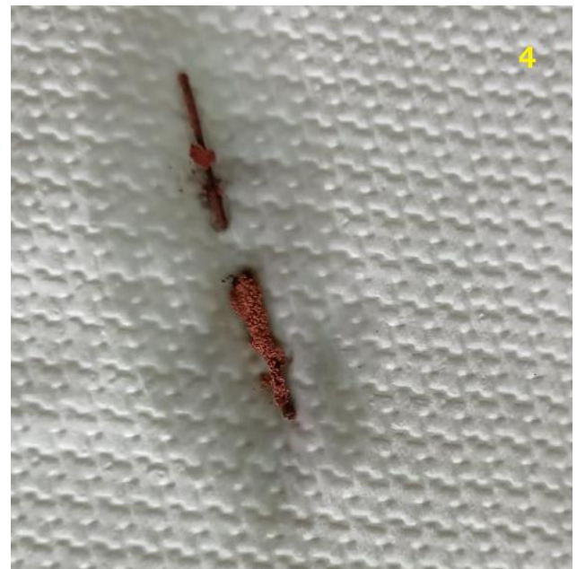
COATING OF COPPER IS DEPOSITED ON THE IRON NAIL

More reactive metal displaces less reactive metal from its salt solution